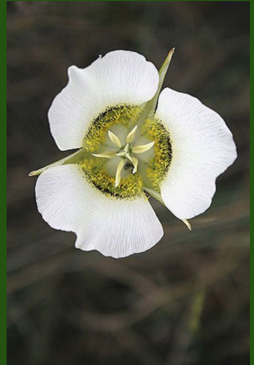
Spot the Wildflower: Mariposa Lily